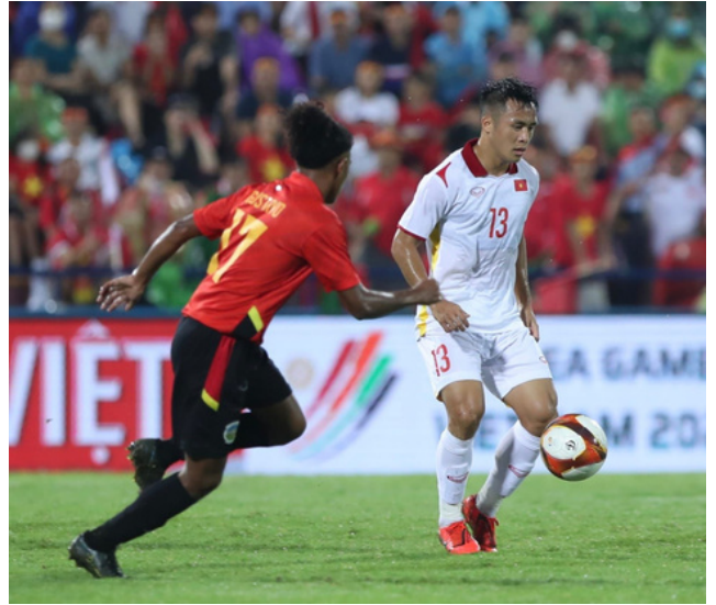
31st Sea Games Timor vs Vietnam

The victory against a competitive Malaysian side is a significant achievement for Timor-Leste U23, indicating their technical abilities, tactical understanding, and determination to succeed. The match provided valuable insights for the coaching staff to assess the team's strengths and areas for improvement.