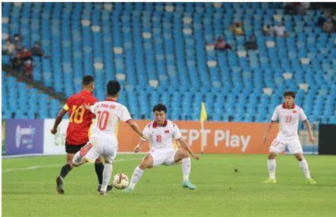
Timor Leste vs Vietnam 3-5

Timor-Leste reached the semi-finals for the first time in the U-23 age category, setting the stage for a highly anticipated clash against Vietnam. The match was closely contested, with both teams displaying defensive resilience and attacking intent. After a goalless draw in regular time, the match went to a penalty shootout. Despite a valiant effort, Timor-Leste fell short, with Vietnam winning 5-3 in the shootout.