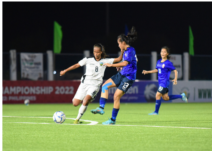
Timor Leste vs Cambodia 0-6