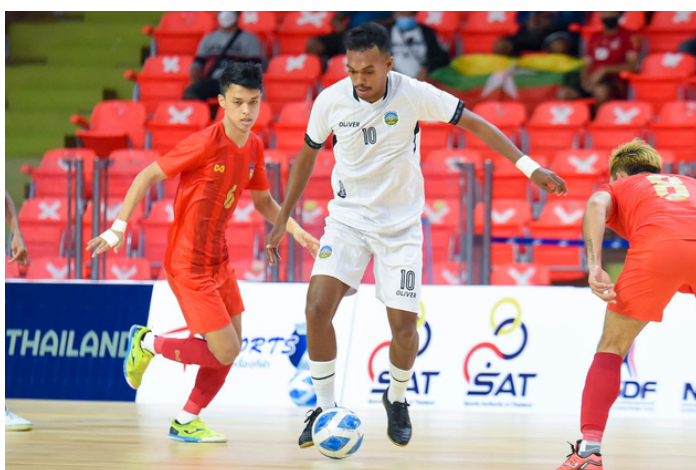
Timor-Leste vs Myanmar