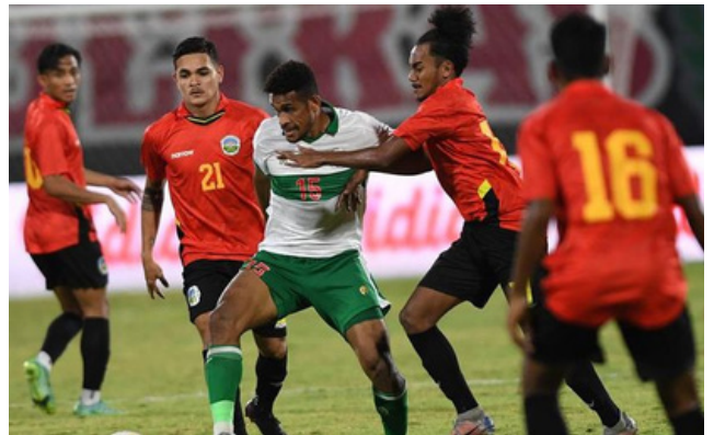
31st Sea Games Timor Leste vs Indonesia