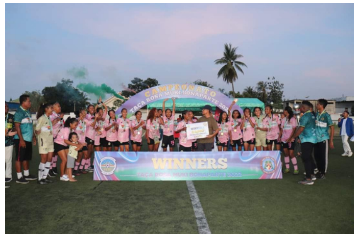
1st Place in Taca Rosa 'Muki' - S'Amuser FC