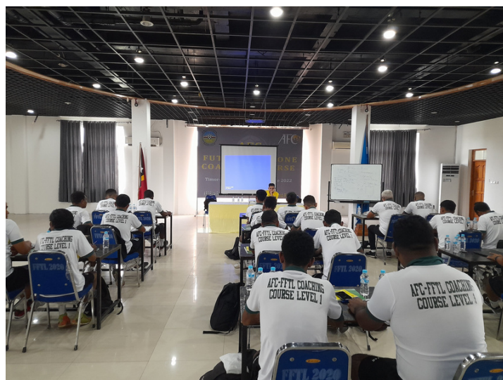
2nd day theoretical lesson