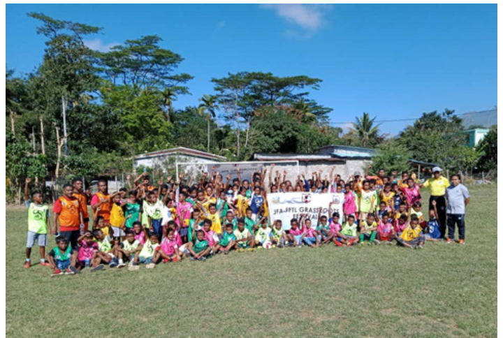
Grassroots activity in Ainaro Municipality