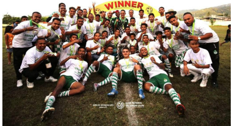
1st Place in Top division Clubs Karketu FC

The challenges faced by the Timorese League emphasize the importance of consistent financial backing and investment in football infrastructure to ensure its smooth operation and growth. Securing adequate funding and attracting sponsors will be crucial in overcoming these challenges and establishing a sustainable and competitive football environment in Timor-Leste.