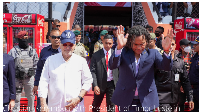
Christian Karembeu with President of Timor Leste in Stadium Dili Municipality