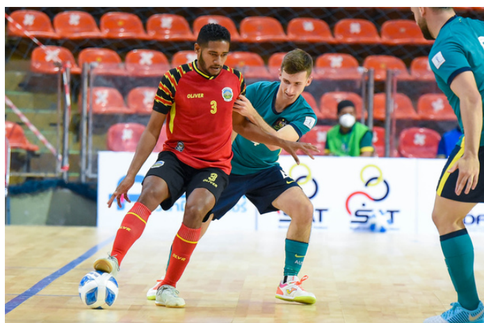
Timor-Leste vs Australia

While the results may not have been favorable, the Timor-Leste team can analyze their performances, identify areas for improvement, and work towards enhancing their skills and tactics. Their participation in the tournament lays a foundation for future growth and improvement, aiming for better results in upcoming competitions.