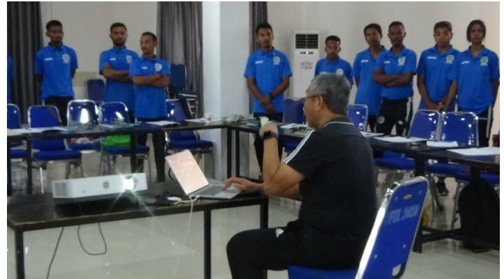
Participants attend theoretical lesson

FCTL continues to prioritize referee development through ongoing programs and initiatives.