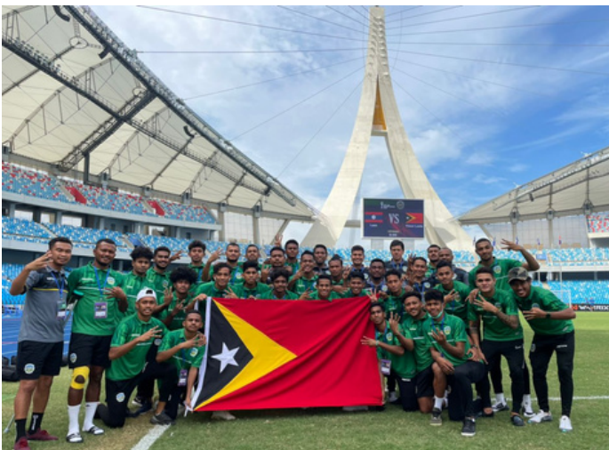
3rd Place AFF U-23, 2022

Due to the unfortunate circumstances of the Laos team, who were unable to participate in the third-place match due to COVID-related issues, Timor-Leste was awarded third place by the AFF. In a display of sportsmanship, Timor-Leste declared the intention to share the third-place position with Laos, highlighting the spirit of fair play and camaraderie in the competition.