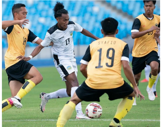
Timor Leste vs Brunei Ds 3-1

Timor-Leste continued the impressive form in the group stage, securing a convincing 3-1 victory over Brunei DS. The team displayed excellent teamwork and capitalized on scoring opportunities, showcasing the potential to succeed in the tournament.