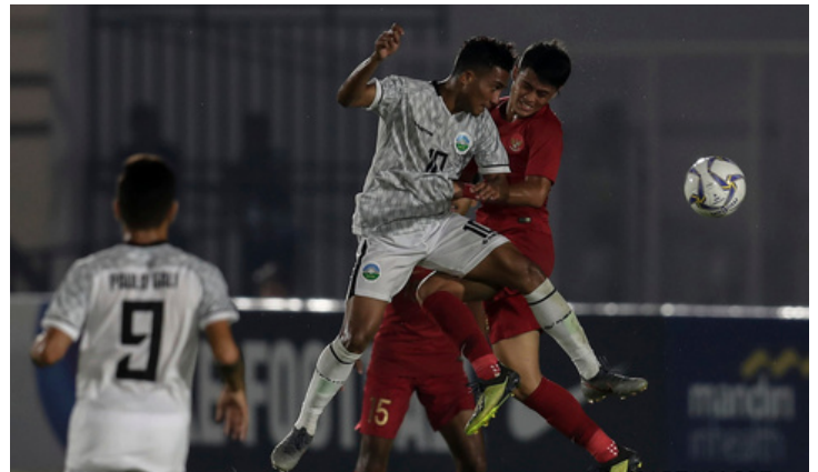
Match 2: 30th January 2022 Indonesia vs Timor-Leste 3-0

Timor-Leste displayed resilience and managed to score a goal, but Indonesia quickly responded with a counterattack goal, securing their victory. The second friendly match between Indonesia and Timor-Leste ended in a 3-0 victory for Indonesia. Despite Timor-Leste's defensive efforts, Indonesia managed to score three goals. The matches provided valuable learning experiences for Timor-Leste's team, highlighting areas for improvement in defence and attack.