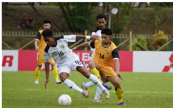
Timor-Leste vs Brunei Ds

While their journey in the AFF Mitsubishi Electric Cup ended at the qualification stage, it serves as a steppingstone for their football development journey and provides motivation to strive for better results in upcoming tournaments.