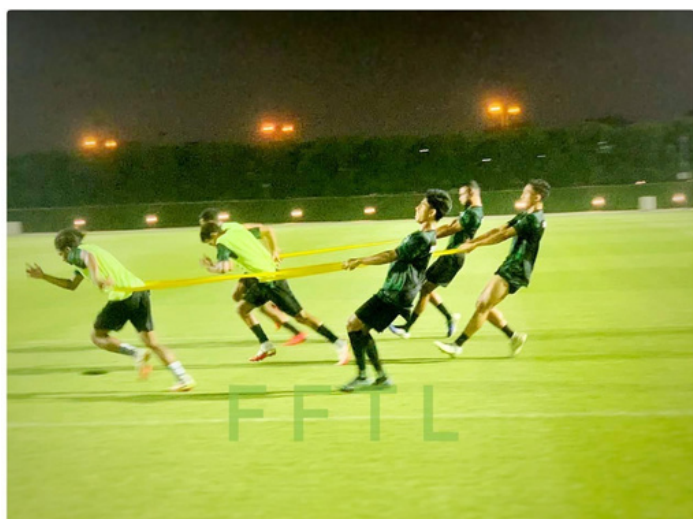
U23 Team Training Camp in Doha, Qatar