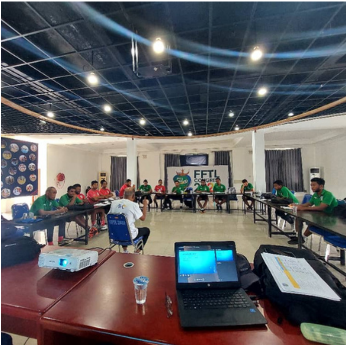
Participants attend theoretical lesson