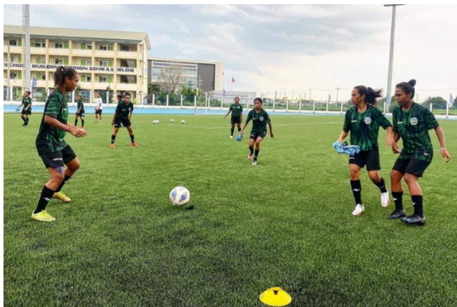
Senior Women's National Team- Training Camp in Bali

Although Timor-Leste faced setbacks throughout the tournament, their journey provided valuable learning experiences and opportunities to showcase their skills on a regional level.