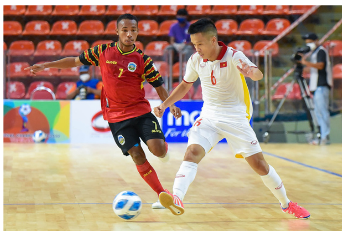
Timor-Leste vs Vietnam