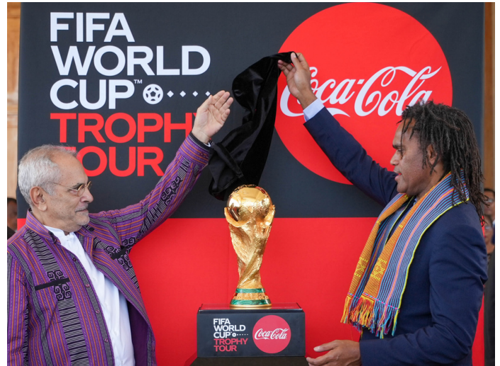
Christian Karembeu with President of Timor Leste in Presidential Palace

The highlight of the event was the unveiling of the FIFA World Cup Trophy on stage, which captivated the spectators. Fans eagerly took turns to have their photographs taken with the trophy, creating a sense of camaraderie and excitement. The presence of the trophy in Timor-Leste served as a reminder of the nation's football passion and aspirations to participate in the World Cup in the future.