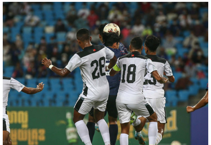
Timor Leste vs Cambodia 1-0

In a crucial match against the host nation, Timor-Leste displayed great determination and discipline. The team emerged victorious with a narrow 1-0 win over Cambodia, showcasing the defensive solidity and ability to seize key moments in the game.