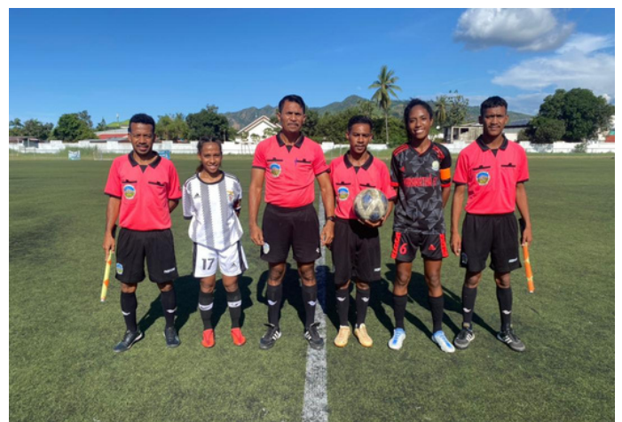
AD. SLB vs Maranatha FC