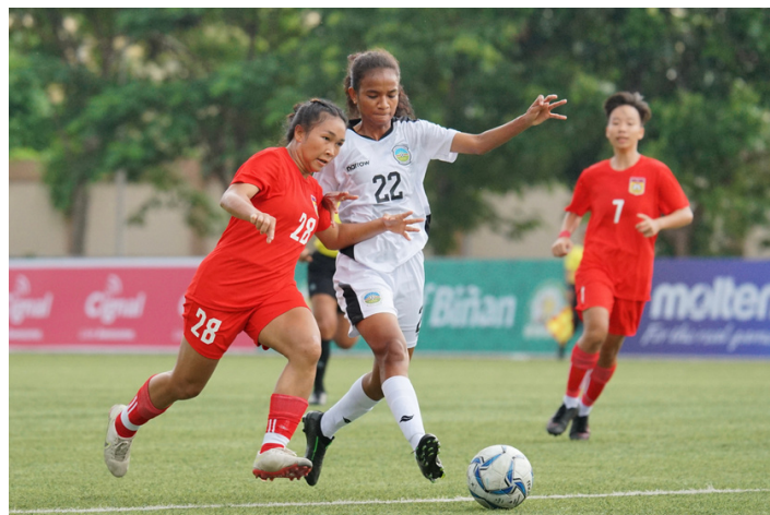
Timor Leste vs Laos 2-0