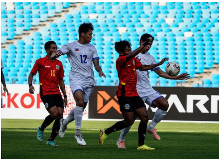
Timor Leste vs Philippines 2-2

In the first group stage match, Timor-Leste showcased the attacking prowess, securing a hard-fought 2-2 draw against the Philippines. The match was characterized by intense competition and skillful play from both sides, highlighting Timor-Leste's ability to compete against strong opponents.