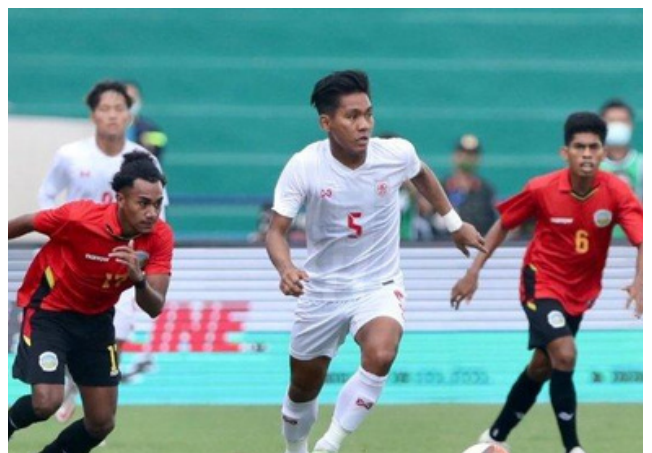
31st Sea Games Timor Leste vs Myanmar