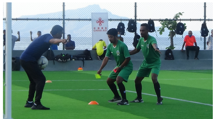
Participants attend practical lesson