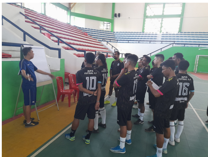
1st day practical lesson