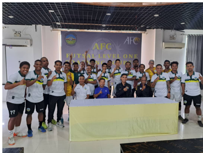
Futsal coaches & Instructors