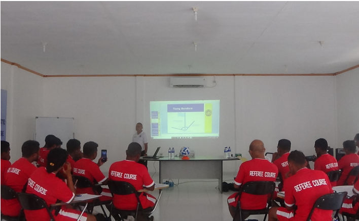
Participants attend theoretical lesson

Through these courses, FFTL demonstrated its commitment to the ongoing development and improvement of referees at all levels. By investing in their education and training, FFTL aims to ensure that referees in Timor-Leste are well-prepared, confident, and capable of officiating matches effectively. This contributes to the overall growth and success of football in the country.