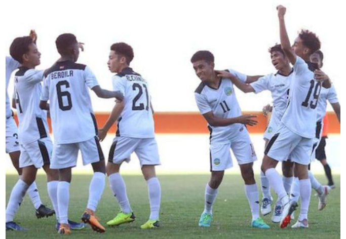
U16 National Team in AFF Championship Yogyakarta, Indonesia

However, in their third group stage match against Thailand, Timor-Leste couldn't secure a win and lost 4-1. Although they didn't advance to the knockout stage, their performance demonstrated potential and progress.