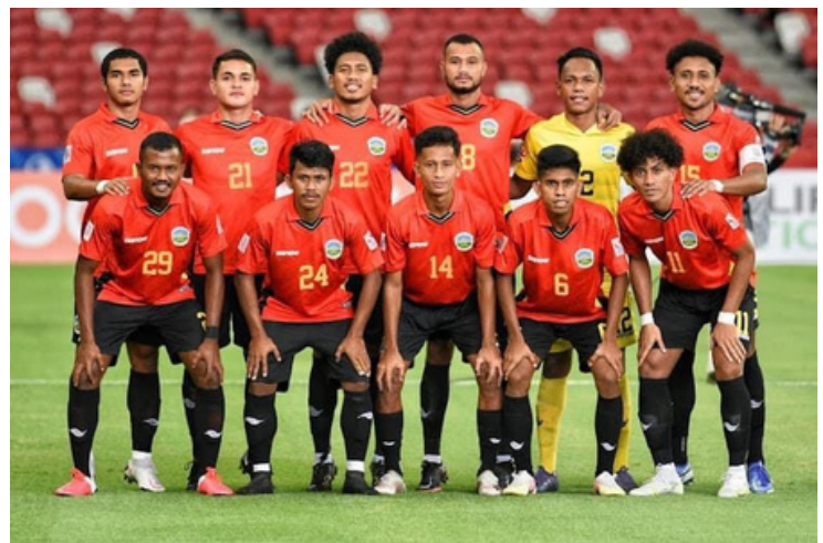
U23 National Team

The coaching staff will analyze the matches and work towards enhancing the team's overall performance in upcoming fixture. With dedication and training, Timor-Leste has the potential to achieve success in international football.