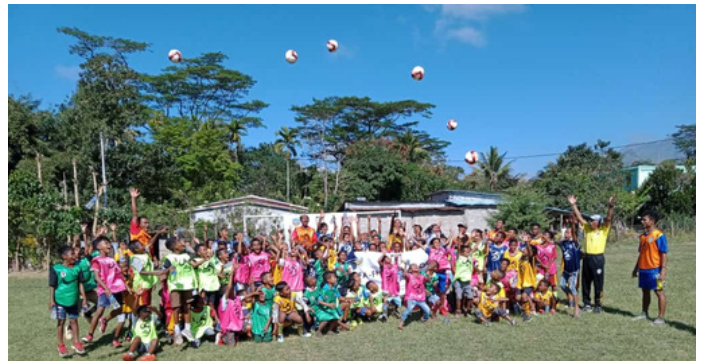
Grassroots activity in Ainaro Municipality

In 2022, several grassroots festivals were held, providing young players with opportunities to showcase their skills, engage in friendly competitions, and embrace the spirit of the game. These grassroots activities not only contribute to the growth of football at the grassroots level but also support the overall talent development pipeline in Timor-Leste.