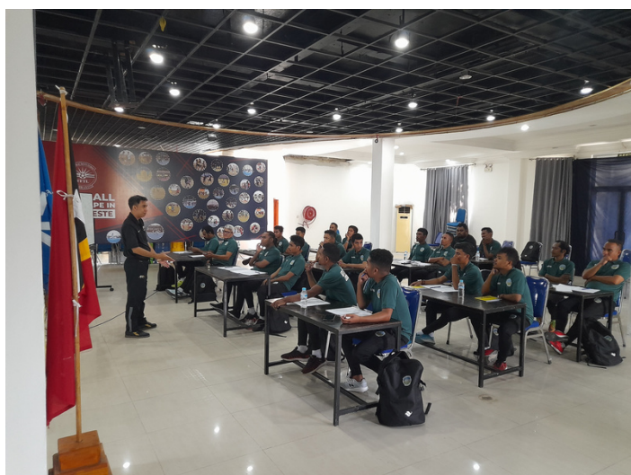
1st day - Theoretical lesson