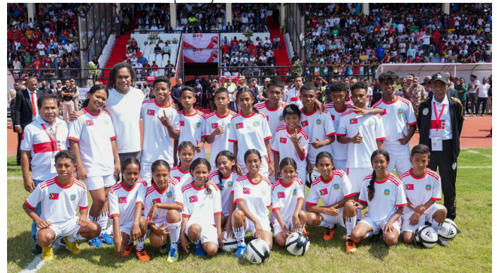
Christian Karembeu with the representative young players