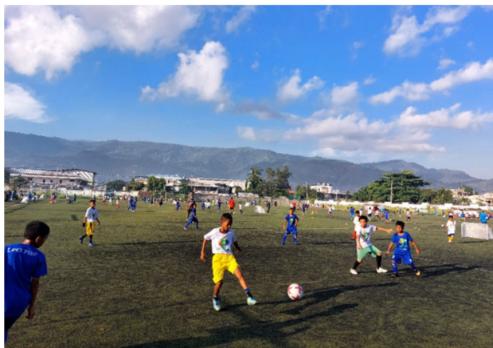
Grassroots activity in FFTL

FFTL's investment in coaching courses and grassroots activities highlights their dedication to the technical development of football in the country. These initiatives aim to enhance the quality of coaching, identify and nurture promising young players, and establish a strong foundation for the future of football in Timor-Leste.