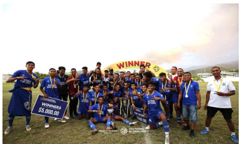
1st Place in Second division Clubs DIT FC