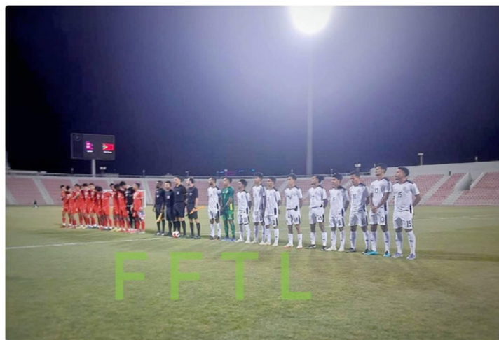
Friendly Match Nepal vs Timor Leste

Timor-Leste's national team 'A' played a friendly match against Nepal as part of their training camp in Doha. Timor-Leste took an early lead with two goals, but Nepal showed resilience and fought back, eventually equalizing the score at 2-2. The match ended in a draw, highlighting the competitive nature of both teams. The training camp and friendly match provided valuable opportunities for Timor-Leste to enhance their skills and team dynamics. The experience gained will contribute to the team's growth and development in future competitions. Timor-Leste can now reflect on their performance and continue working towards their goals with renewed confidence.