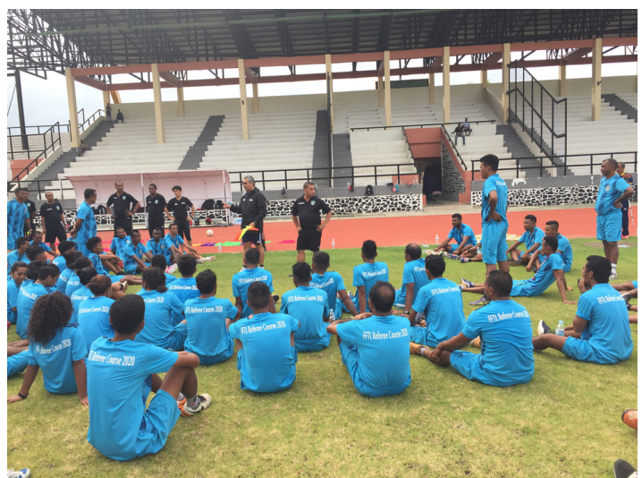
Participants attend fitness test on the field