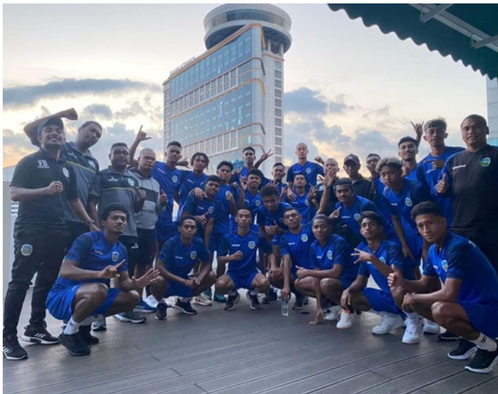
U19 National Team in AFF Jakarta , Indonesia

In their final group stage match against Cambodia, Timor-Leste performed impressively, securing a convincing 4-1 victory. Despite facing challenges, Timor-Leste ended their group stage campaign on a positive note with two wins and two losses.