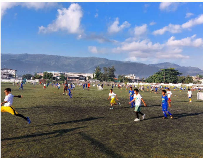
Grassroots activity in FFTL