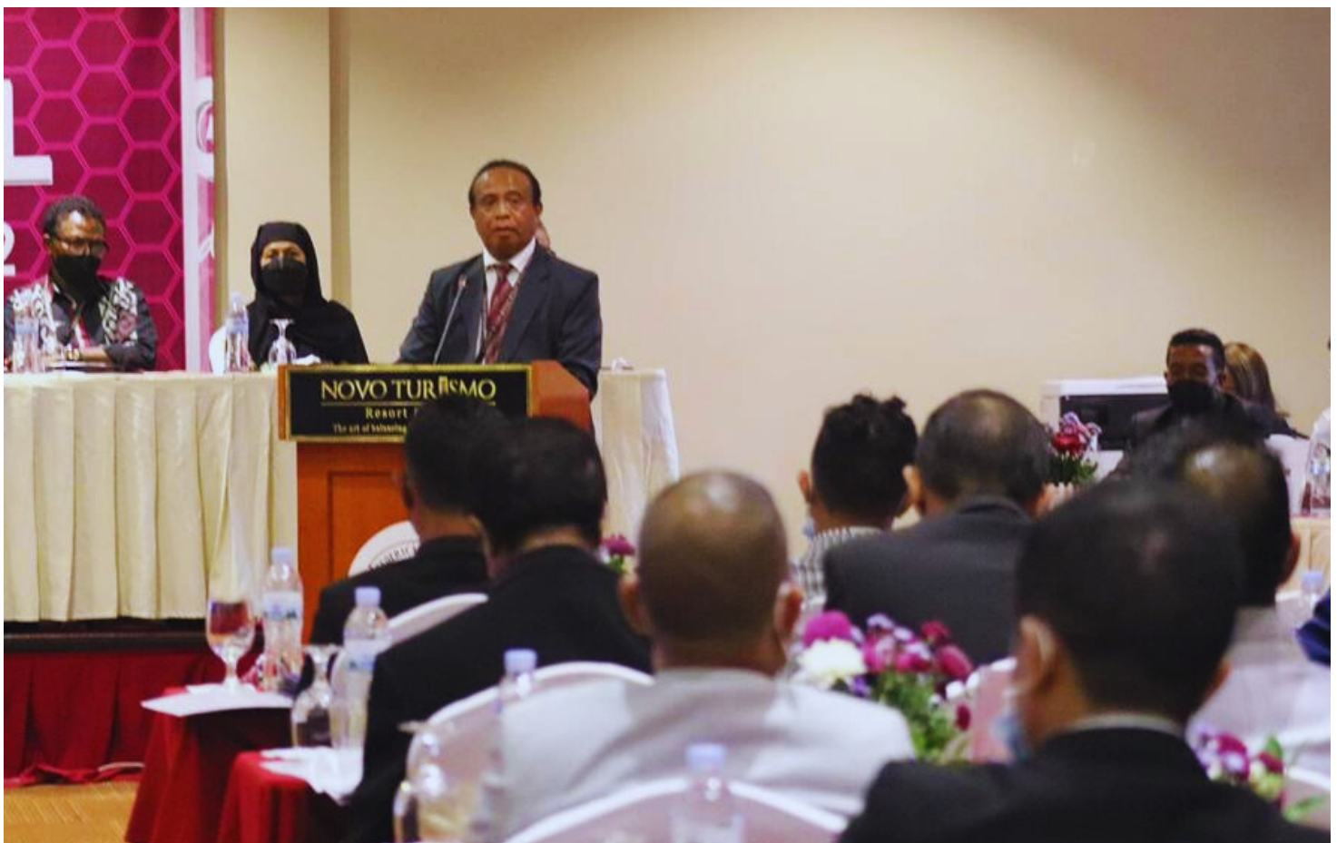
7th FFTL Congress, Novo Turismo Hotel, Dili

By successfully and transparently conducting the 7th FFTL Congress and implementing innovative financial procedures, FFTL showcased its dedication to fostering improved governance practices. These initiatives also created a platform where all stakeholders could actively contribute to the progress and advancement of football in Timor-Leste.