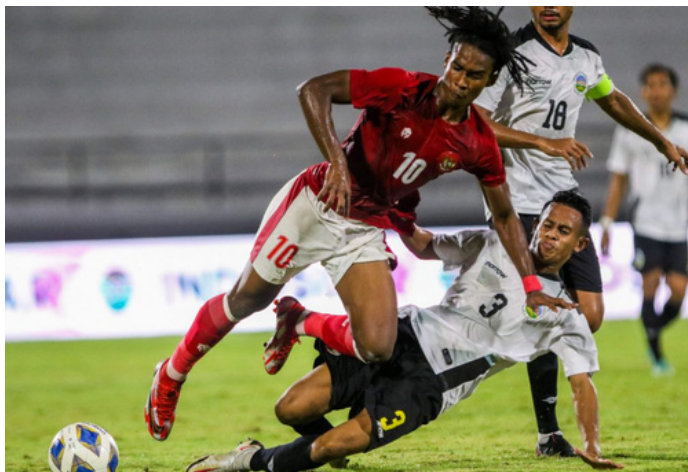
Match 1: 27th January 2022 Indonesia vs Timor-Leste 4-1

The match was an opportunity for both teams to prepare for future competitions. Indonesia defeated Timor-Leste with a score of 4-1. Indonesia showcased their attacking abilities, scoring early in the game and adding two more goals before halftime.