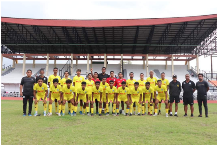
U20 National Team in AFC Asian Cup, Jakarta, Indonesia

In the final group stage match on September 18, 2022, Timor-Leste played against Hong Kong, China. Despite their challenging start in the tournament, the Timorese players showed their determination and fighting spirit, securing a hard-fought 2-1 victory. This win highlighted their resilience and ability to compete, even in the face of adversity.