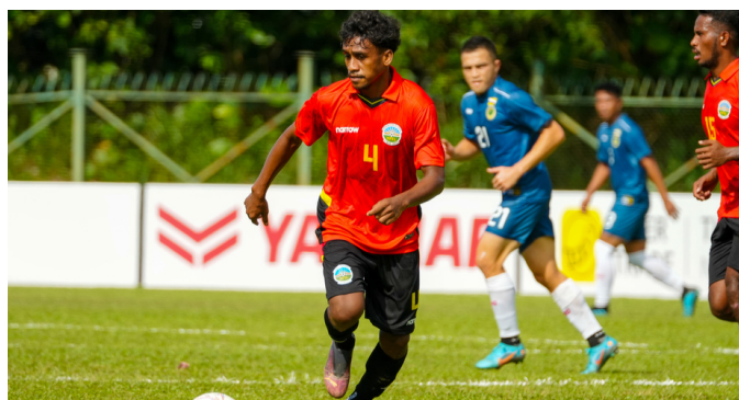
Timor-Leste vs Cambodia