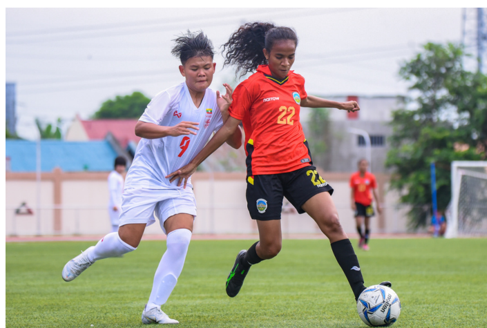
Timor Leste vs Myanmar 0-7