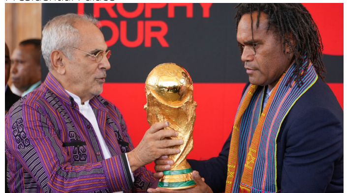
Christian Karembeu with President of Timor Leste in Presidential Palace