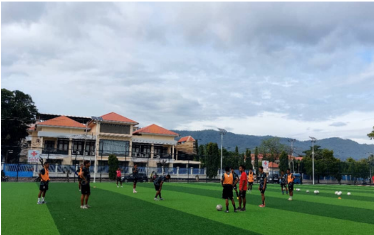
Participants attend practical lesson