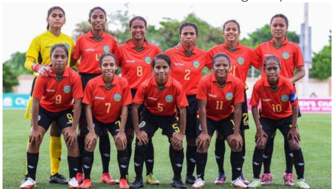
Senior Women's National Team in AFF Women's Championship