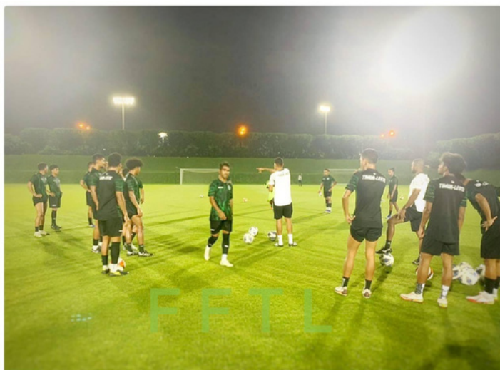
U23 Team Training Camp in Doha, Qatar

Despite their best efforts, Timor-Leste couldn't equalize before the match ended. The final score was 2-1 in favor of Cambodia, who emerged as the winners.