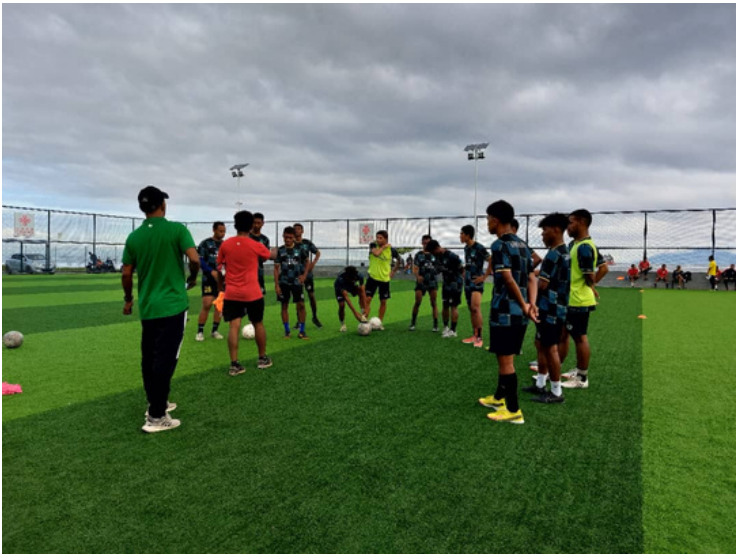
Participants attend practical lesson

These coaching courses play a crucial role in improving coaching quality at all levels, ranging from grassroots to professional. By providing coaches with the necessary skills and knowledge, FFTL aims to elevate the standard of coaching, leading to improved performance by players throughout the country.