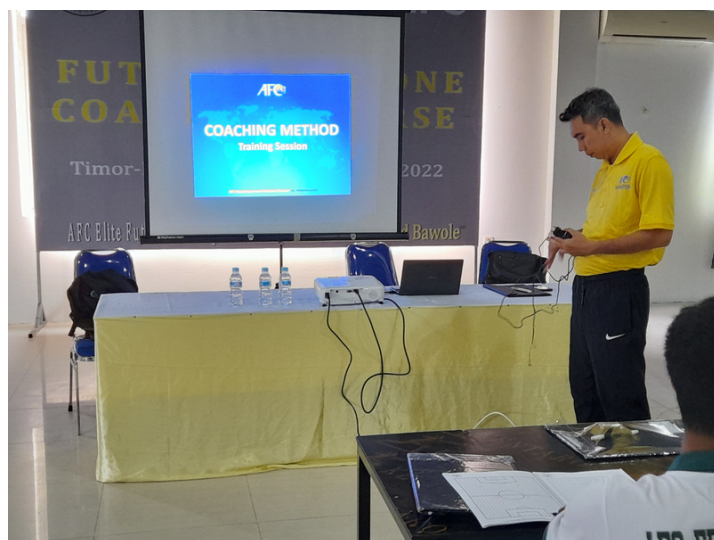
2nd day theoretical lesson