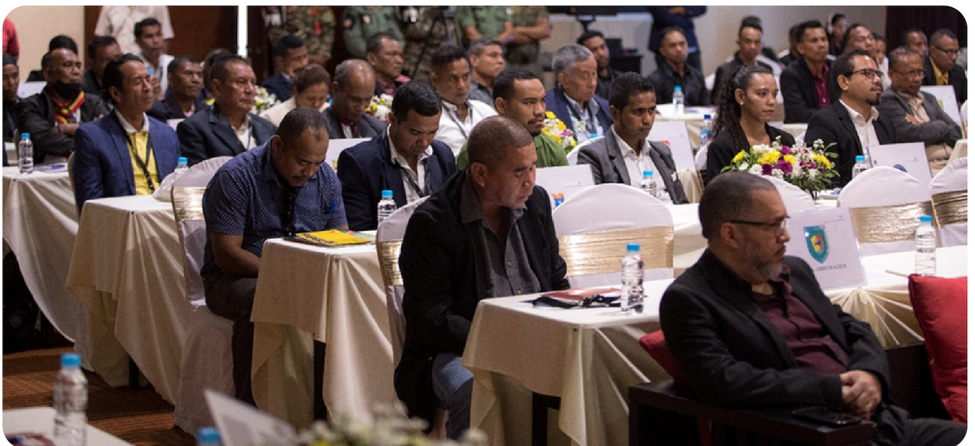
FFTL 8TH ORDINARY CONGRESS. JULY 2023